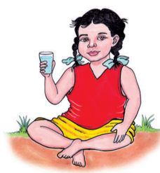
3. Children, people who are ill, and older people (vulnerable people)