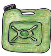
3. With a tight fitting lid