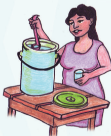
2. With a ladle