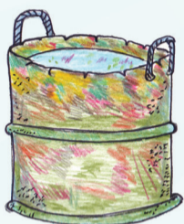
1. Without a lid