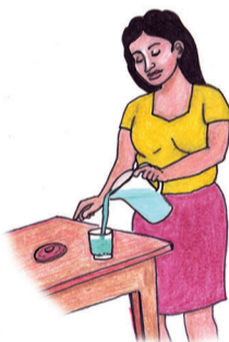
3. With a pitcher and glass