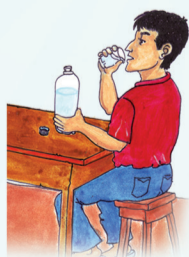
2. Only adults