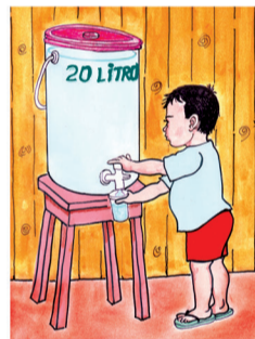
4. Using the container's spigot