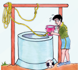
1. No one