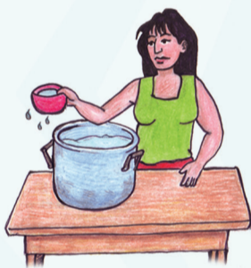
1. With a bowl/ cup