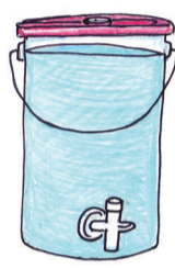
4. With a tight fitting lid and a spigot