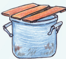
2. With a lid that doesn't fit well