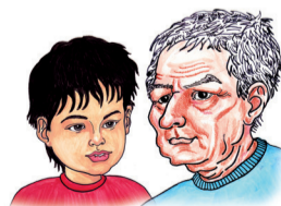
4. Everyone (adults, children, babies)