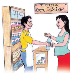
3. At home and sometimes outside the house