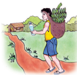
4. Always at home and outside the house