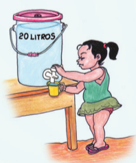
2. Only at home